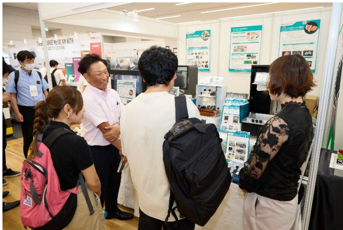
Formnext Forum Tokyo 2023.

Tokyo, 6 September 2024. In less than one month, key additive manufacturing (AM) players will gather for the forum's fifth edition, held 26 – 27 September at the Tokyo Metropolitan Industrial Trade Center HAMAMATSUCHO-KAN. 52 exhibitors from four countries, namely China, France, Japan and Korea, have confirmed participation in this year's event. As a business platform for the latest information on the next generation of additive manufacturing, the event aims to further revitalise the industry by providing opportunities for exhibitors and visitors to connect. As well as giving direct access to new products and technologies on the show floor. The event's seminars will give visitors necessary insights to make informed business decisions – with topics ranging from 3D printing in the construction industry to market insights from Japan and China.