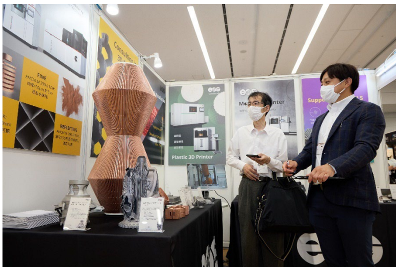
Formnext Forum Tokyo 2023.

As AM technology rapidly advances, innovation, and improved idea implementation are becoming critical for harnessing its full potential. September's event is set to support this through a lineup of 'special seminars' featuring prominent speakers from both domestic and international spheres, alongside 'exhibitor presentations' where companies will showcase their latest products and services. In 2024, 1,500 visitors are expected to attend the two-day event.